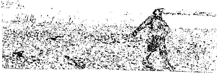
The Sower at Sunset (1888), Vincent van Gogh